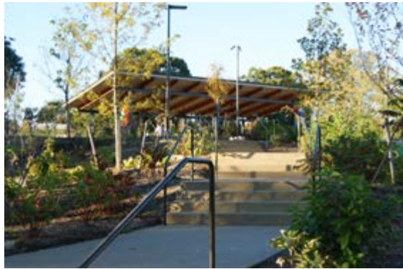
Picnic Shelter, Lakeshore Park, TN (NBW)