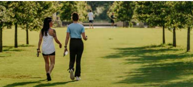
Formal Lawn and Trees, Memorial Park, Houston TX