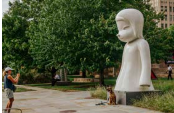
Public Art, Citygarden, St. Louis, MO