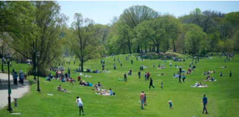
Prospect Park Long Meadow, NYC (Olmsted)