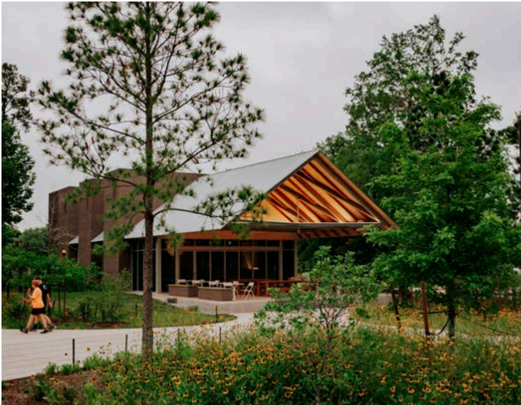
Food/Beverage Concessions, Memorial Park, Houston, TX