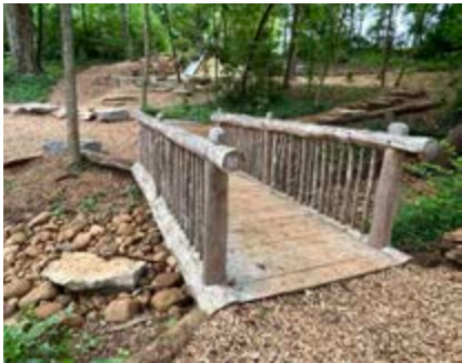
Adventure Play Trail, Lakeshore Park, Knoxville, TN (NBW)