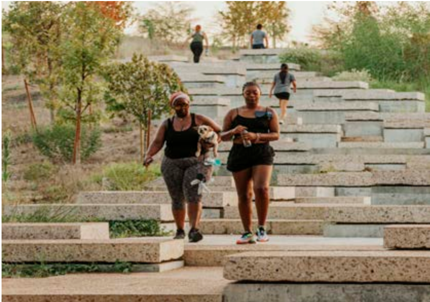
The Scramble, Memorial Park, TX