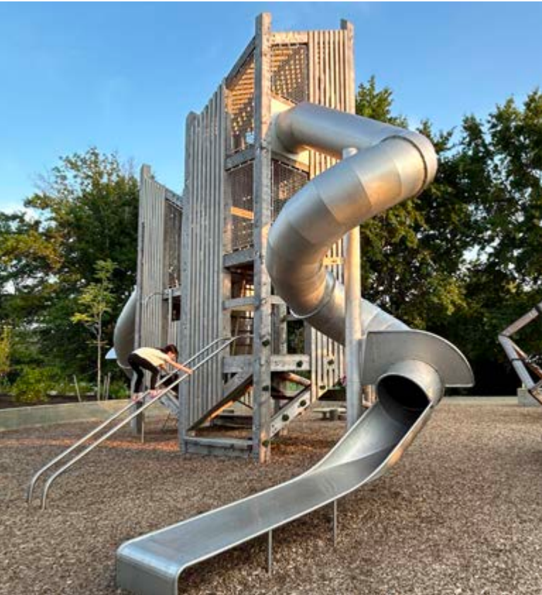
Playground, Lakeshore Park, Knoxville TN (NBW)