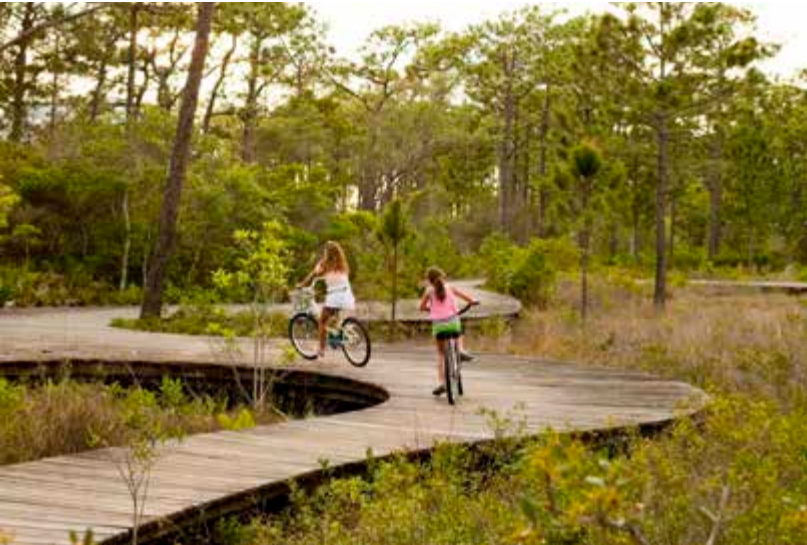
Low Boardwalk Trail, Walton County, FL (NBW)