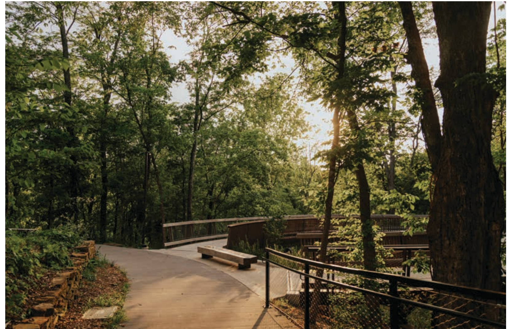
Variety of Trails and Creek Access Experiences, Fayetteville, AR