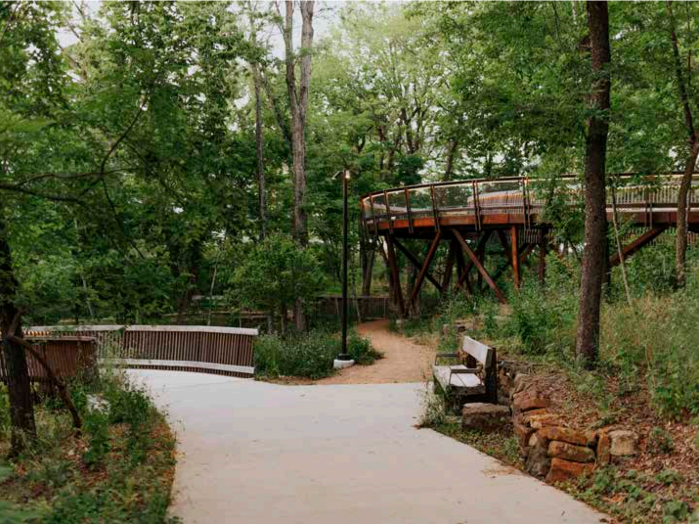
The Ramble, Fayetteville, AR