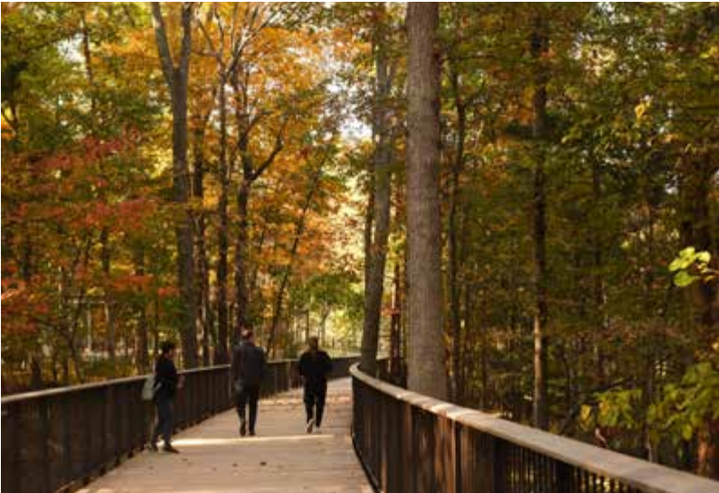
Canopy Walk, Loudoun County, VA (NBW)

The trails at Clear Creek will have a variety of surfaces and slopes to provide accessibility for users of all abilities. The creek canopy walk along the Beltline will be the flattest of the routes and provide ADA-accessible pedestrian-only routes to view the Creek. Then, the trails down to the creek level may be steeper at points and require stairs along the path.