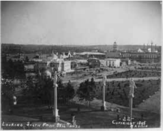
Photograph from the 1895 Exposition