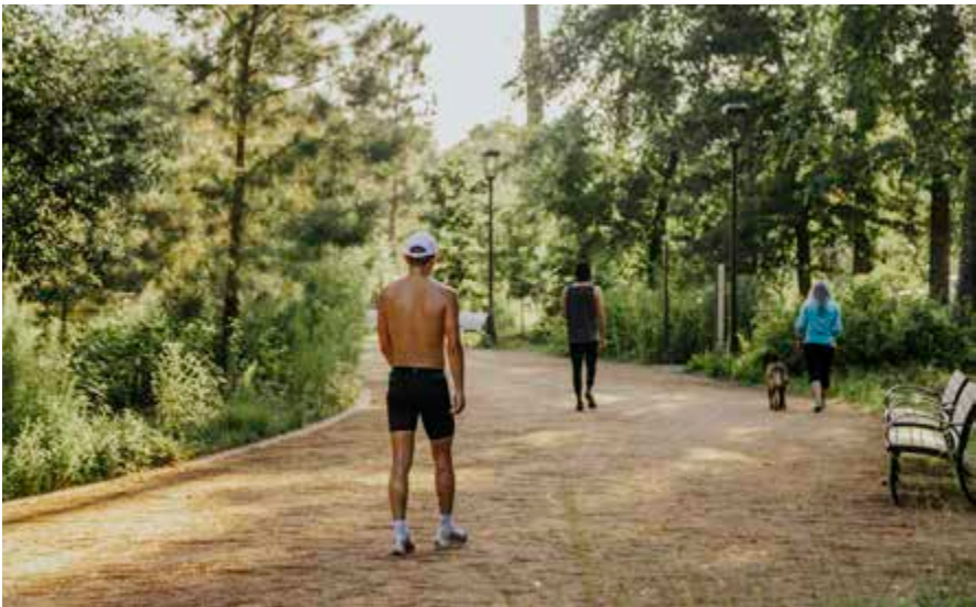
Running Track, Memorial Park, Houston, TX