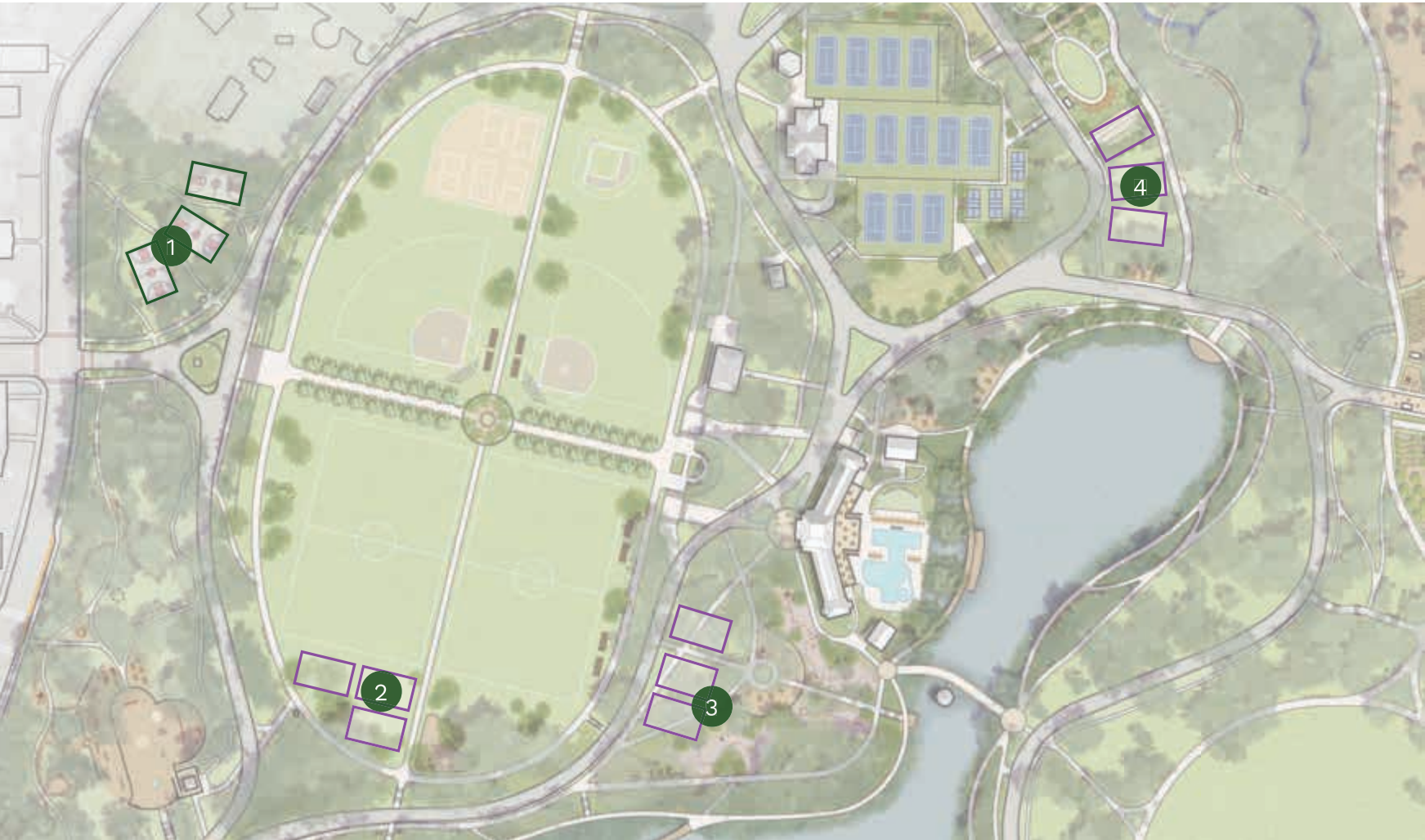
Basketball Courts Alternative Locations

Several locations for pickleball courts were studied, but the location next to the tennis courts will allow pickleball players to continue using the existing dual-lined tennis courts for additional pickleball courts when needed for tournaments and other larger events.