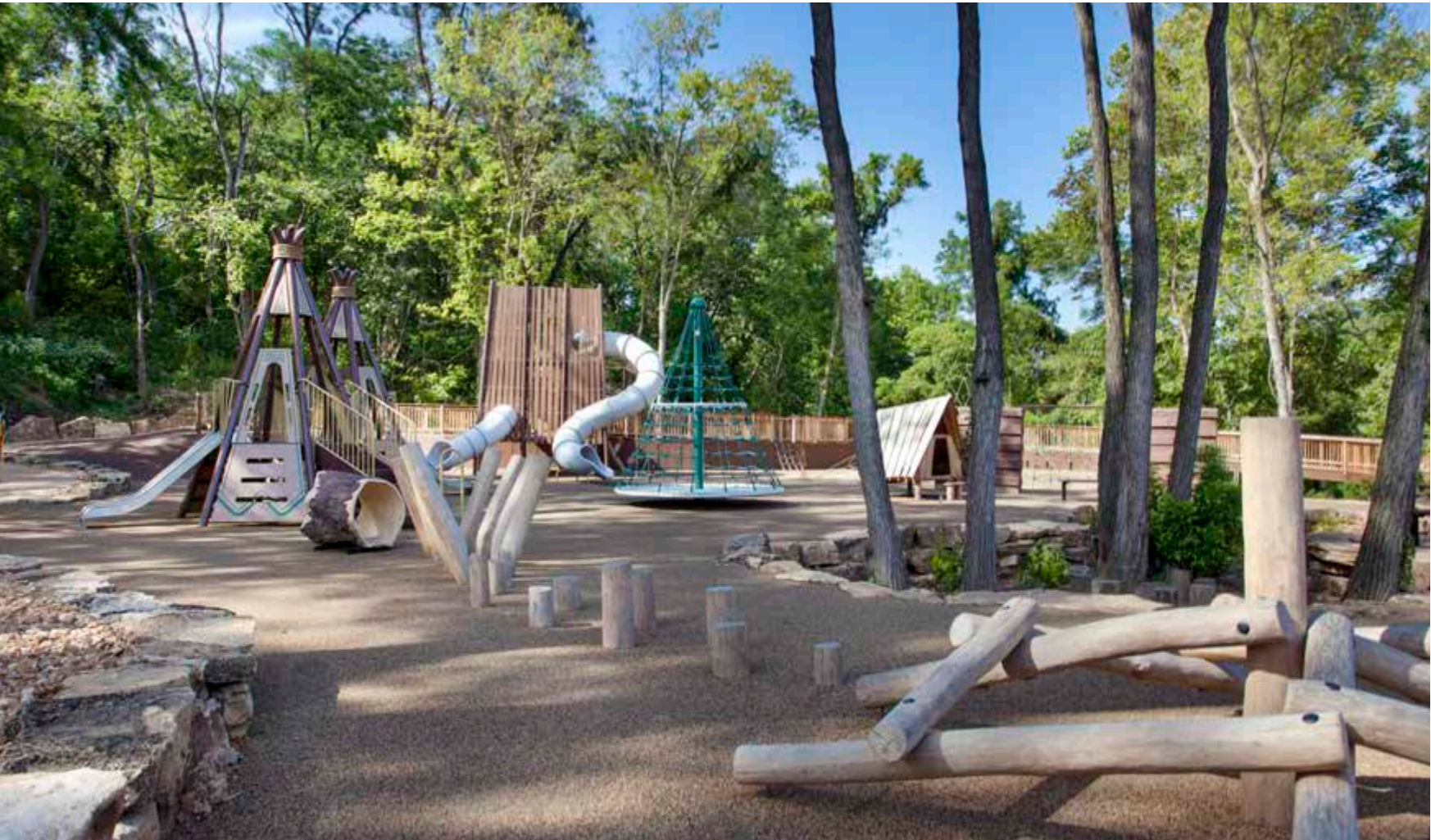
Expansive Playground to Replace Existing Playground, Wildwood Community Park, MO (NBW)