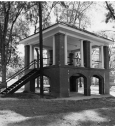
Piedmont Park Bandstand