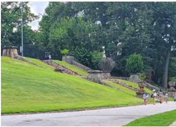
Current-Day Photos of Historic Elements to be Preserved and Cared For at Piedmont Park, Including the Stone Balustrade, Stone Grand Staircases, and the Bandstand