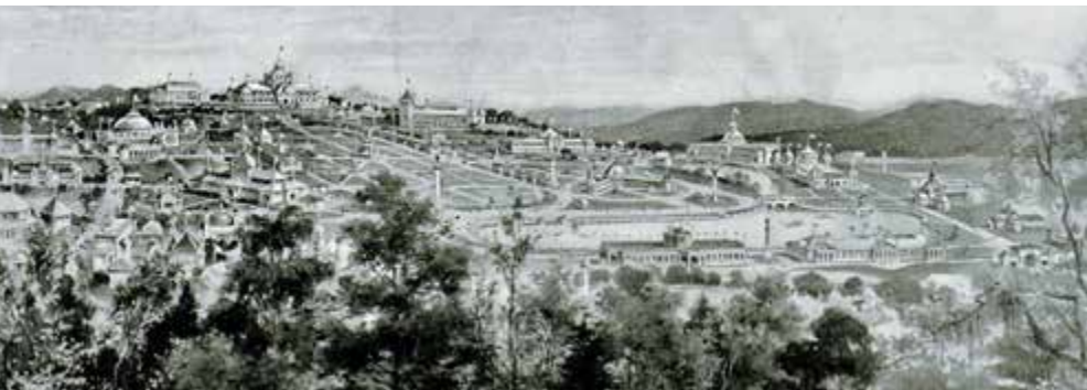
Rendering of the 1895 Exposition