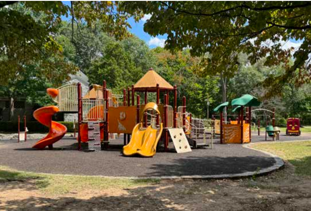
Replace Existing Mayor’s Grove Playground

Mayor’s Grove is directly adjacent to Lake Clara Meer but has few sightlines and views to the water. Opening up more of these views will add to the immersive natural experience of the playground. Along with tree pruning, selective removals, and reworked understory native planting, new seating benches and swings will be added near the playground facing out to the creek.