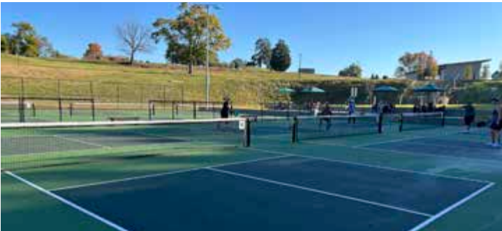
Pickleball Courts, Lakeshore Park, Knoxville, TN (NBW)