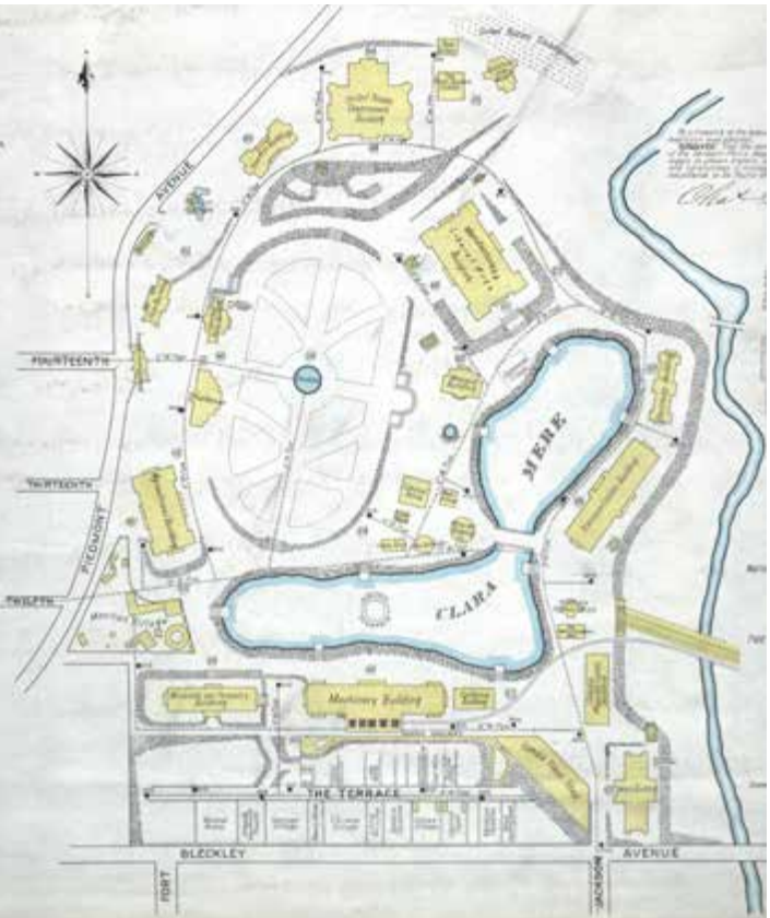
Layout of the 1895 Cotton States International Exposition, When Many of the Historic Park Elements Around the Active Oval Were Built

The Works Progress Administration built the Picnic Shelter in 1936. The space will remain and continue to be rented for small events. The adjacent grills will be replaced, new picnic tables added, and better lighting provided to create a more welcoming space.