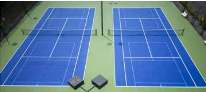
Sample Pickleball Court Striping on Tennis Courts