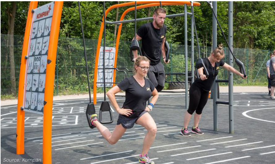
Improved Fitness Equipment