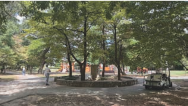
Existing Trees at Mayor’s Grove to Remain