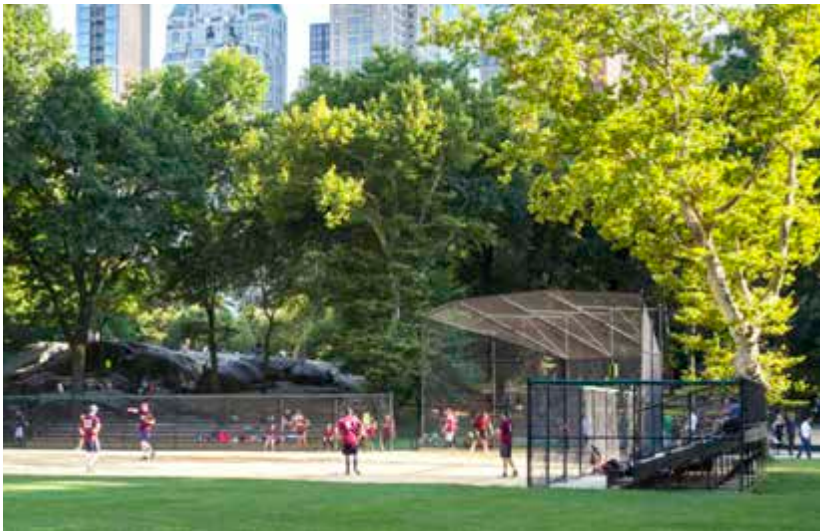
Softball Fields with Bleachers and Shade, Central Park, NY