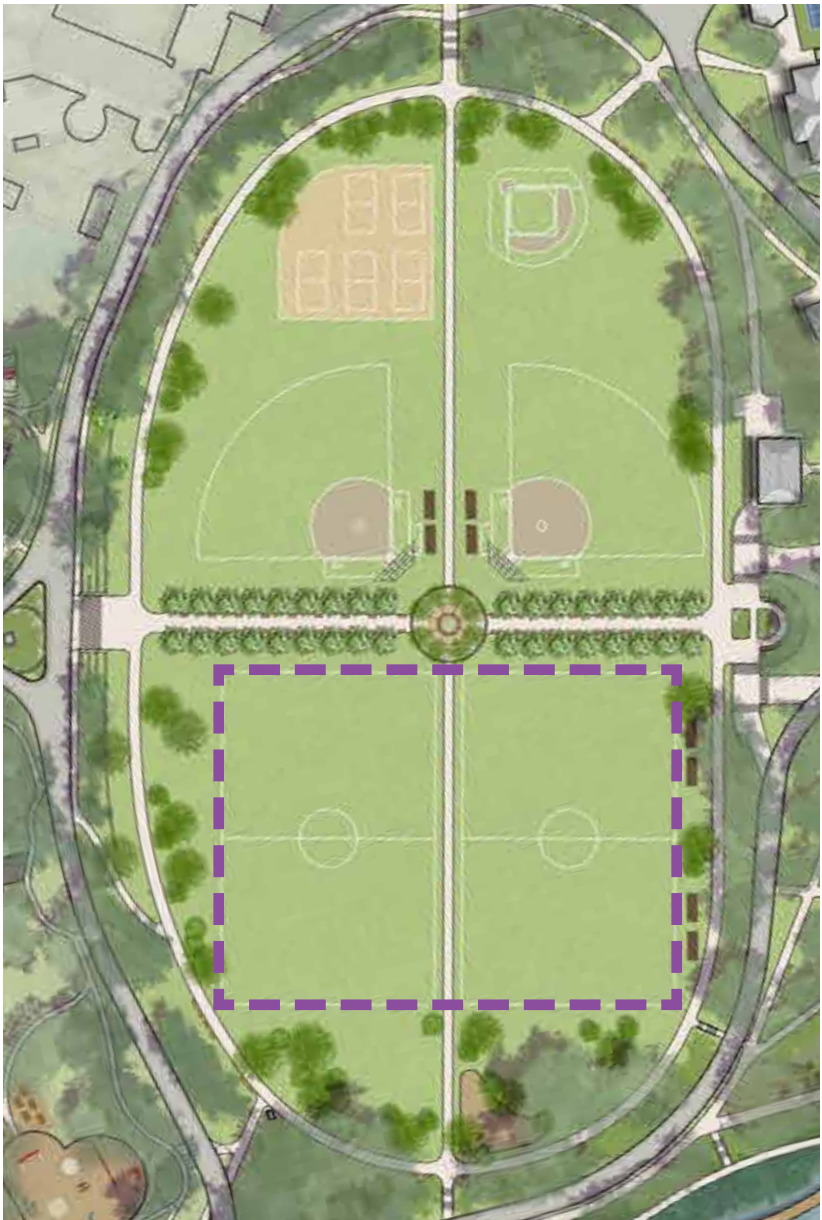
Potential to Combine Lower Half of Active Oval as Single Large Field for Football or Ultimate Frisbee

Miracle League Fields are specifically designed to support children with mental and physical disabilities so they can enjoy the game of baseball. The fields have special field material to allow for wheelchairs and other devices, while also helping to prevent injuries. The proposed field is adjacent to the accessible entrance of the Active Oval.