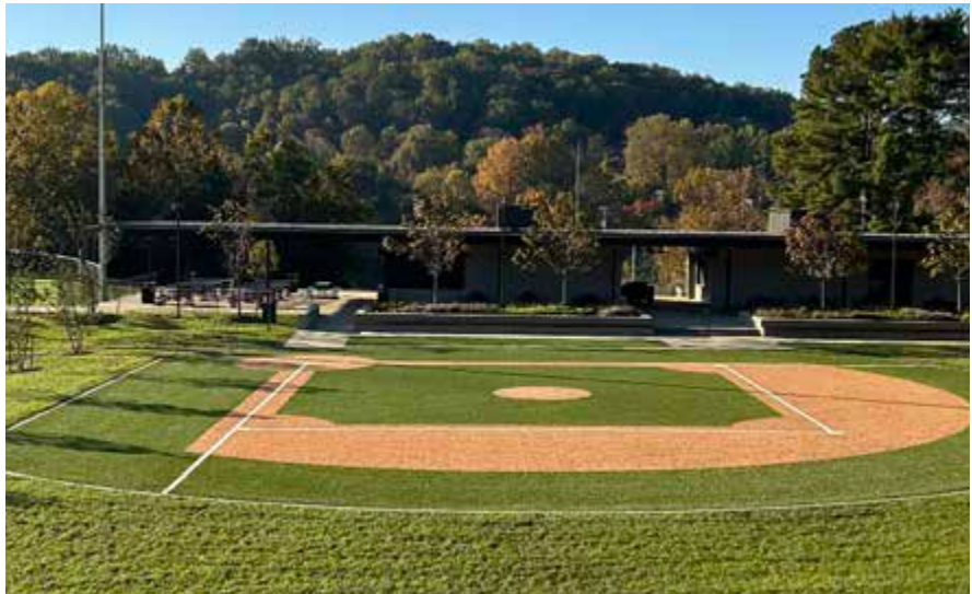
Challenger/Miracle Field, Lakeshore Park, Knoxville, TN (NBW)